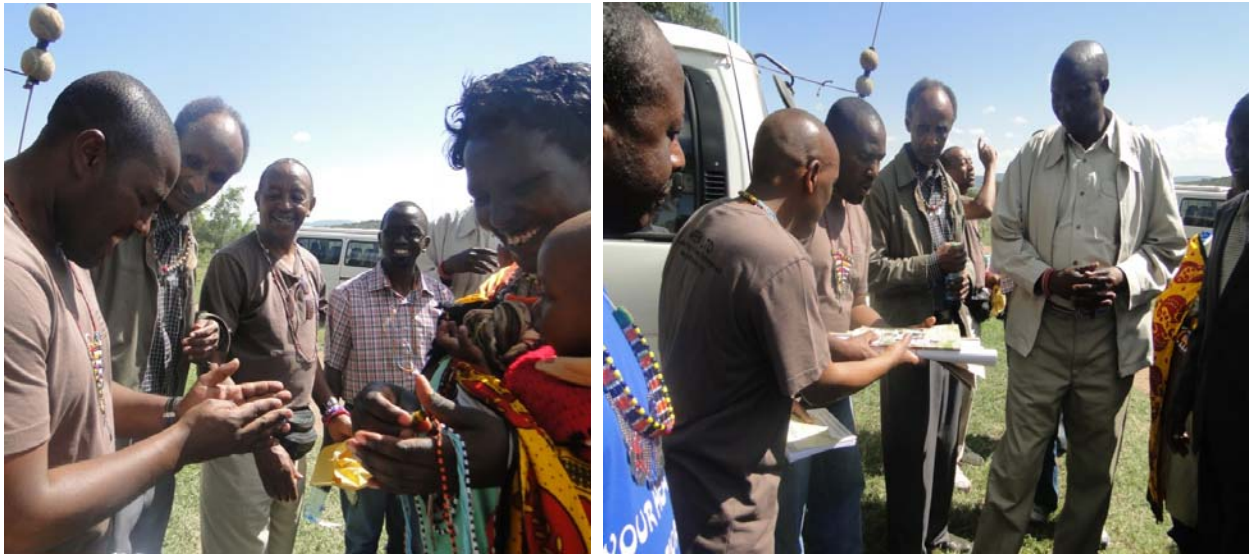
A sign of appreciation as per Maasai tradition; Handing over of environmental awareness materials produced by AFEW to the school