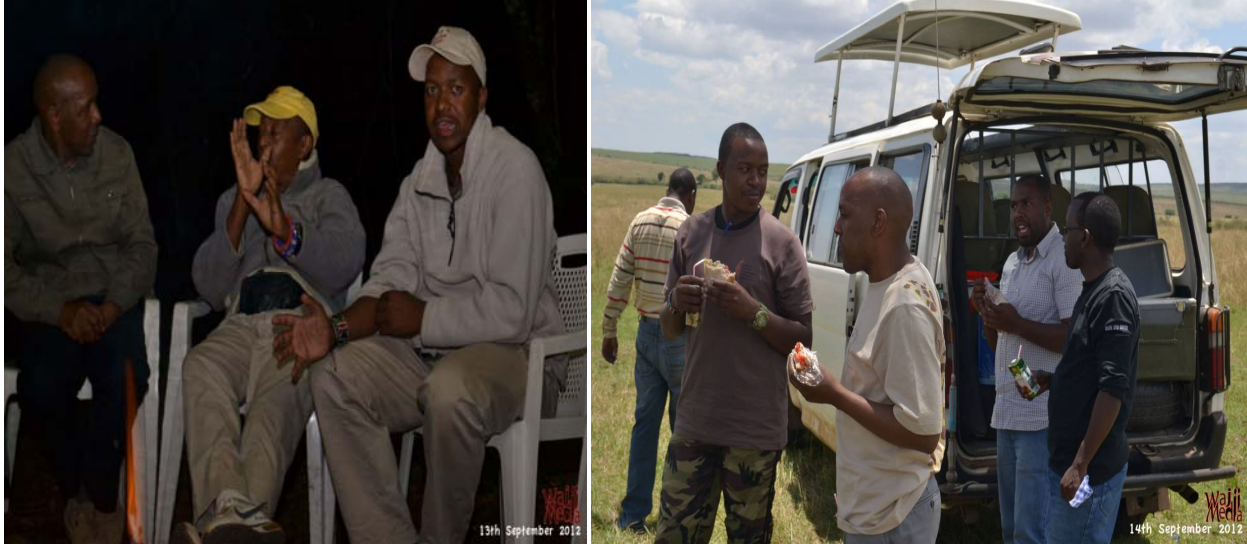
A born fire discussion on the way forward and time to compare notes; a breakout during a game drive at the Mara reserve